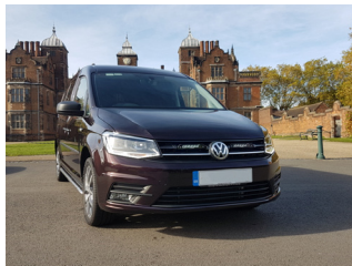
VW CADDY 2015+

Thank you for choosing a Lazer Lamps product. Vielen Dank dafür, dass Sie sich für ein Produkt von Lazer Lamps entschieden haben. Merci pour choisir un produit de Lazer Lamps. Gracias por la seleccion de productos de Lazer Lamps.