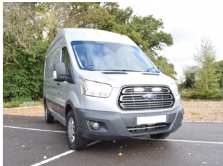
FORD TRANSIT 2017+