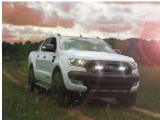
FORD RANGER 2016+