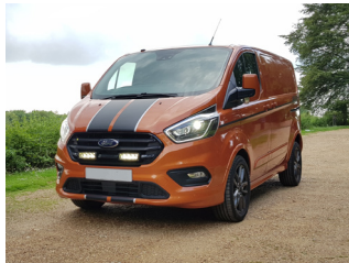
FORD TRANSIT CUSTOM 2018+